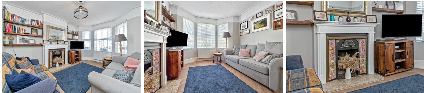
Ground Floor Approx. 427.1 sq. feet

This delightful four/five bedroom Victorian home offers a perfect blend of classic elegance and modern living enjoying this popular residential location. The stylish accommodation arranged on three levels boasts two reception rooms on the ground floor with modern kitchen and downstairs cloakroom. On the first floor, there are three well-proportioned bedrooms with family bathroom providing ample space for families or those seeking a comfortable home. There is a thoughtfully converted loft, which features an office/bedroom 5, additional shower room and a lovely main bedroom with Juliet balcony- all combining to add a touch of luxury and privacy to the conversion. One of the standout features of this property is the large garden, a rare find in urban settings. This outdoor space is perfect for entertaining gardening enthusiasts, children at play, or simply enjoying a peaceful afternoon in the sun. The Victorian charm of the house is evident throughout, with period features that add character and warmth. The property is well-situated, offering easy access to local amenities, schools, and transport links, making it an ideal choice for families and professionals alike.